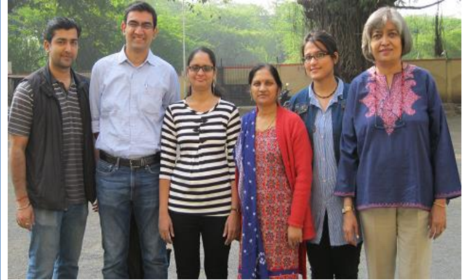
Project Udaan Teachers - Working hard to fulfil the goal