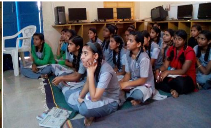
Project STEM: Hutatma School Teacher using Gclass App to teach Math to the students. Students focus on understanding the concepts visually