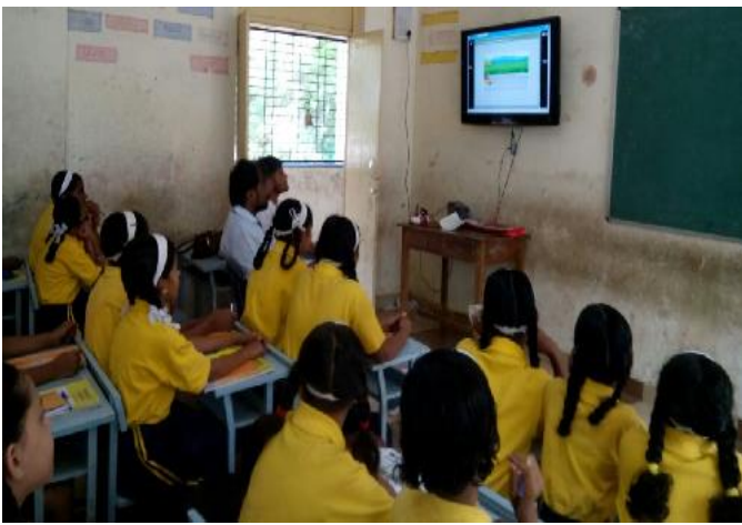
Quiz session in class : Project STEM