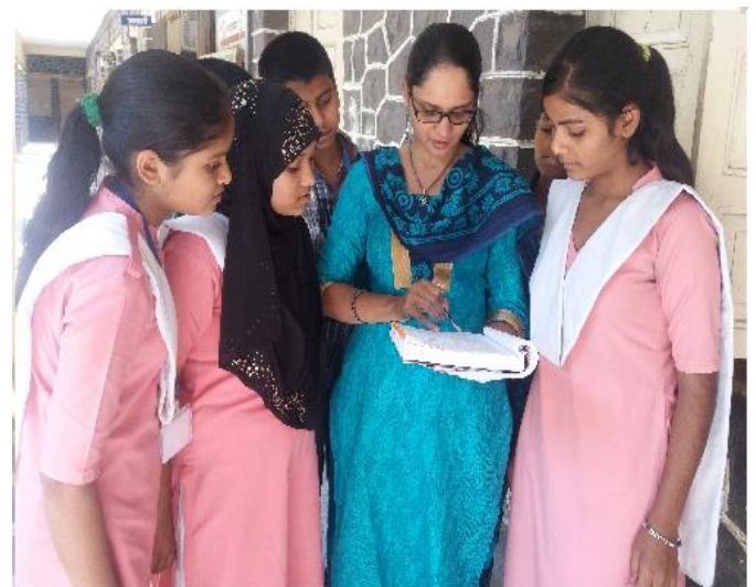
Students clearing their doubts with their Physics teacher