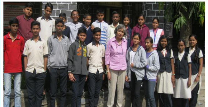
Project Udaan students with their English teacher