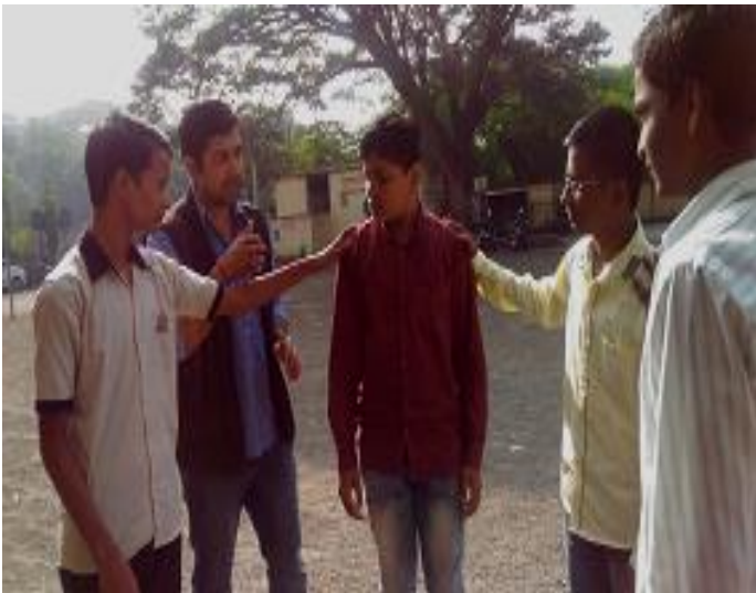
Students learning the Ion bond concept from their Chemistry teacher