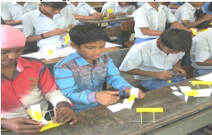
Students of class 8 assembling the windmill during their science class at Dr. Ambedkar Memorial Technical High School