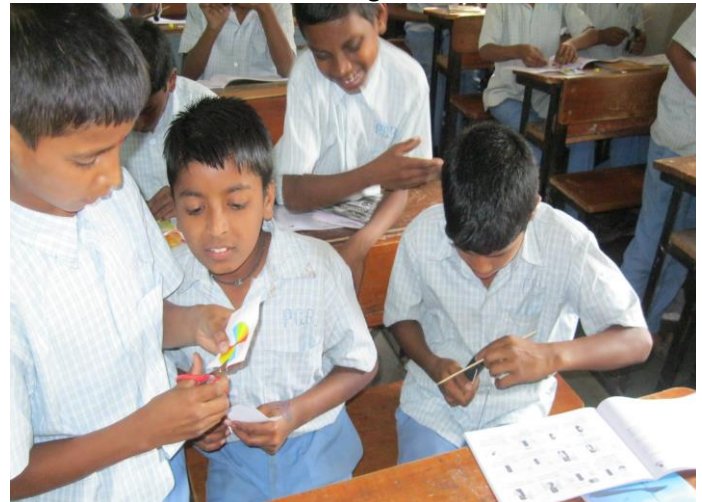
Class 7 students making Newton's color disc at Mahadji Shinde High School