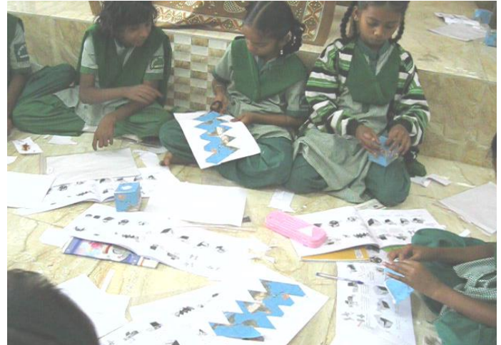
Class 6 doing their science activity- square earth & round earth at Lal Bahadur Shastri High School